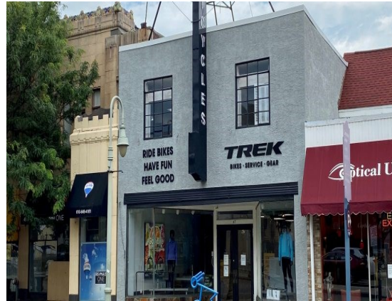
Front tenant - Trek Bikes